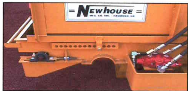
CROSS-FEED ADJUSTABLE FOR PREFERENCE OF GARLIC ROW LOCATION.