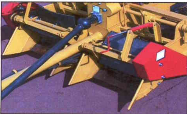
BLADES ARE LIFTED/LOWERED SIMULTANEOUSLY WITH CONTROL FROM THE TRACTOR.