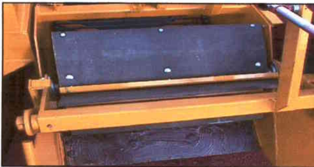
RUBBER PADDLE WHEEL ASSISTS GARLIC ONTO CONVEYER CHAIN.