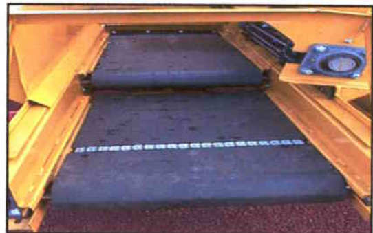
CROSS FEED EXTENSION SECONDARY BELT MOVES IN OR OUT WITH REMOTE CONTROL FROM TRACTOR TO PUT FOUR ROW TOGETHER.