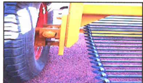
ADJUSTABLE WHEELS: WHEELS ARE ADJUSTABLE VERTICAL AND HORIZONTALLY FOR LEVELING AND ROW WIDTHS.