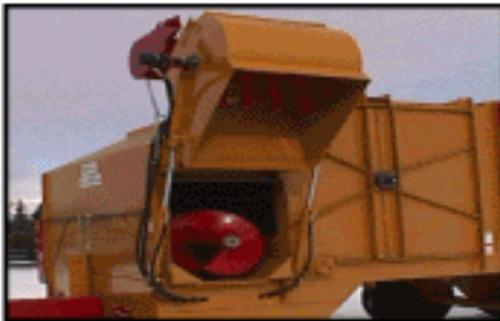
RAISED FULLY TO ALLOW MATERIAL TO DISCHARGE WITHOUT REMOVING THE BLOWER. USED FOR BUNKER FEEDING OR DISCHARGING MATERIAL ON THE GROUND