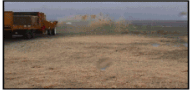
WIDE, EVEN SPREADING OF MATERIAL, 50 FEET OR MORE (DEPENDING ON MATERIAL & WIND)