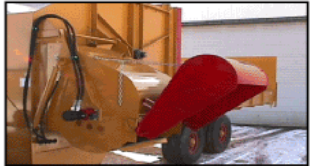
CONTROL HOOD IN RAISED POSITION FOR SPREADING