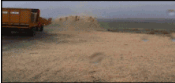
STRAW BEING BLOWN ON FIELD TO STOP WIND EROSION & or COVER CROP