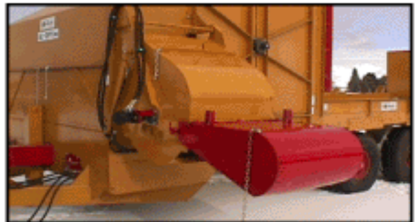
CONTROL HOOD IN DOWN POSITION THAT IS ADJUSTABLE TO DIRECT MATERIAL IN DESIRED LOCATION