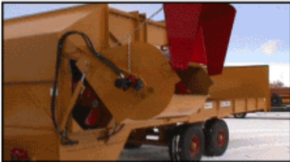
TWIN HYDRAULIC CYLINDERS USED TO RAISE BLOWER AWAY FROM DISCHARGE AUGER IF PLUGGING STARTS