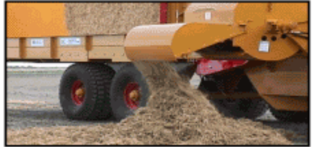
CONTROLLING DISCHARGE INTO A NARROW STRIP, SUCH AS FILLING WHEEL RUTS