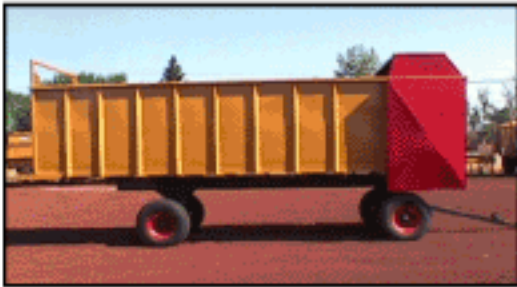
22 ft. Feed Box w/ top hinged rear door.