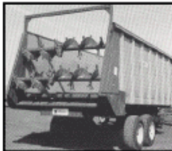
A NEWHOUSE BOX w/ SPREADER ATTACHMENT.