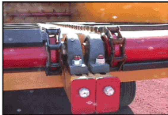
Independent Drag Idlers, With 1-15/16" Shaft & Steel Idler Rims Were Designed for Reverse Operation in Rear Unloading. HD D667X Chain Self Cleans to Prevent Sprocket Build-Up