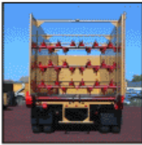
BACK VIEW OF BEATERS WITH SEALED DOORS LOCKED OPEN FOR SPREADING