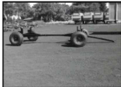
NEWHOUSE FARM WAGON, 10 TON, w/ AUTO STEERING & ADJ. TONGUE