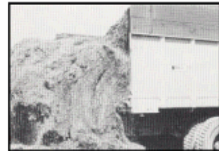
UNLOADING GREEN ENSILAGE IN LESS THAN 3 MINUTES JUST BY FLIPPING HYDRAULIC VALVE LEVER TO REVERSE POSITION