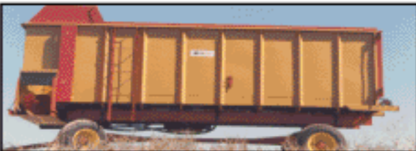
18 ft. Feeder Box, Mounted on a Newhouse Farm Wagon w/ Side Hinged Rear Doors.