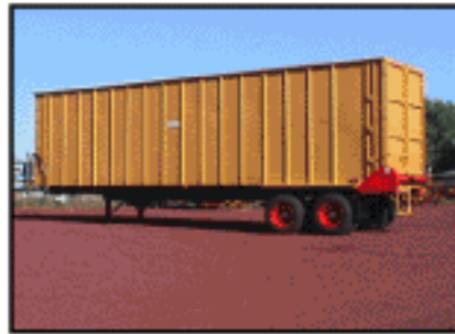
A 34' X 8' TALL SPREADER BOX FOR SPREADING