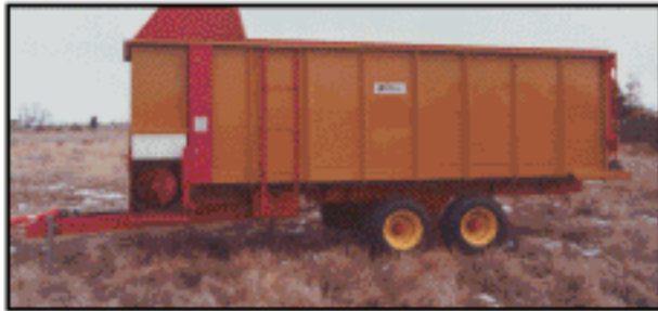
Feeder Box Mounted on Tandem Axle Trailer.