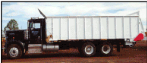
Farm Box With Spreader Attachment