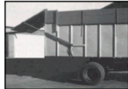
REAR UNLOADING, CHOICE OF THREE STYLES OF TAILGATES. TOP HINGED, SIDE HINGED, OR HYDRAULICLY OPENED