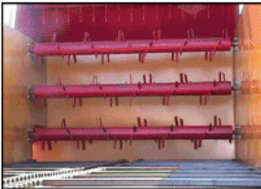
3 Beaters Made of HD Pipe & 1-1/2" shaft, Including Anti Wrap Guards to Protect Bearings