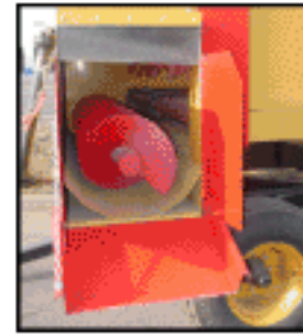
CROSS FEED 16" AUGER OR DRAPER CHAIN.