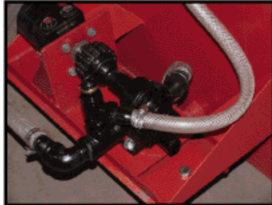
PUMP, MOTOR, RELIEF, & RE-CIRCULATING SYSTEM ARE ALL MOUNTED TO THE SIDE OF THE TANK.