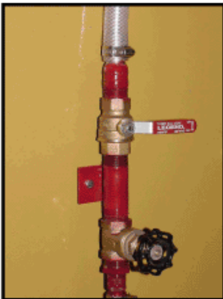
ADJUSTABLE FLOW AND SHUT-OFF VALVES.