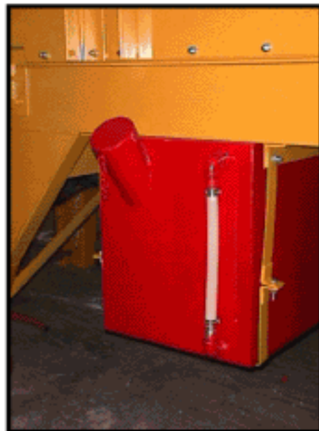
LARGE RESERVOIR, (40 GAL) WITH LIQUID LEVEL SIGHT GAUGE, AND LARGE FILL NECK WITH CHAINED ON CAP.