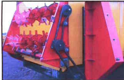
BEATER DRIVE TRAIN SINGLE AND DOUBLE # 80 ROLLER CHAIN, SHIELDED BY HINGED CHAIN GUARD.