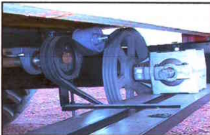
RIGHT ANGLE GEAR BOX DRIVEN BY 3, "B" BELTS WITH A SPRING LOADED TIGHTNER.