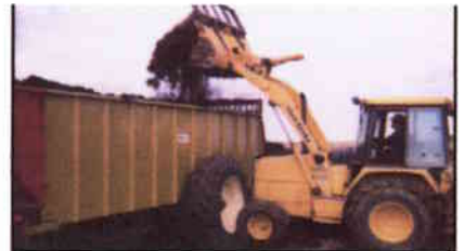
LOW PROFILE MAKES SIDES LOWER FOR COMFORTABLE E-Z FILLING WITH A LOADER.