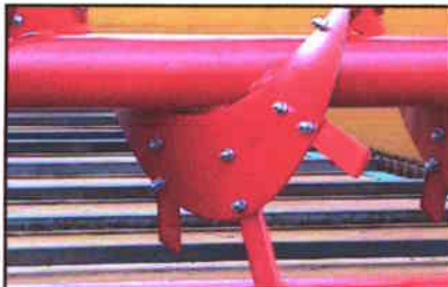
REPLACEABLE ALLOY STEEL BOLT-ON BEATER TEETH.