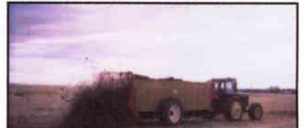
SPREADS EVEN AND FAST APPROXIMATELY 8 TO 10 MINUTES PER LOAD.