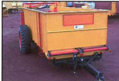
EXTRA INCLINE LADDER AND SCREW JACK.