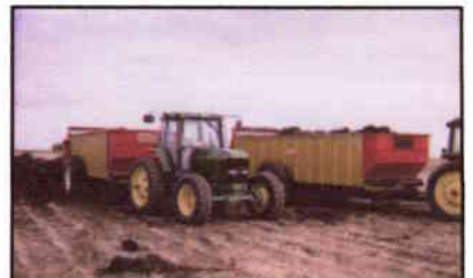
A LARGE CANADIAN FARM USING TWO NEWHOUSE SPREADERS.