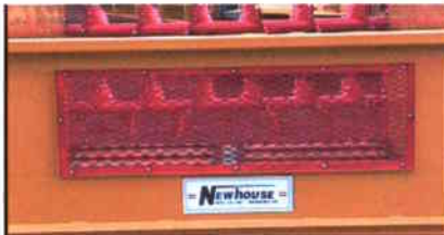
SCREEN WINDOW FOR VIEWING LOAD.