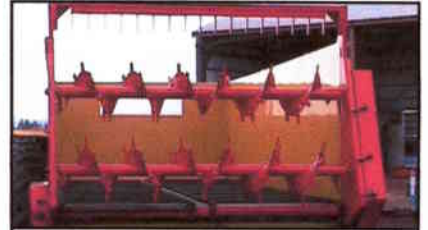
AUGER BEATERS ARE WELDED TO HEAVY WALL TUBE WITH A 2" SOLID SHAFT RUNNING THE FULL LENGTH FOR EXTRA STRENGTH.