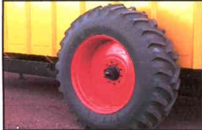
LARGE TRACTOR TIRES FOR EASY PULLING AND LESS GROUND COMPACTION.