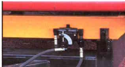
ADJUSTABLE SPEED CONTROL FOR FLOOR DRAG CHAINS.