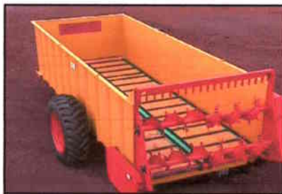
2, PAIR OF D667X DRAG CHAINS CONSISTING OF CHANNEL FLIGHT BARS AND EACH STRAND OF CHAIN HAS ITS OWN ADJUSTMENT TAKE-UP FOR PROPER TENSION. 1/4" UHMW IS USED TO PREVENT WEAR AND FRICTION.