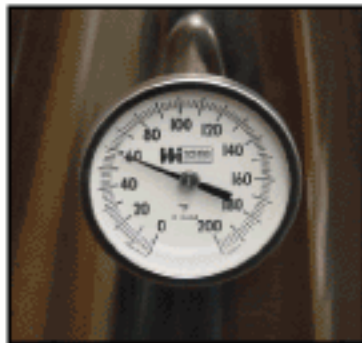
BUILT-IN GAUGE FOR SETTING AND INSPECTING TEMPERATURE.