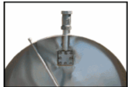
UNDER SIDE SHOWING DRAIN PIPE, INPUT COMPRESSION COUPLER FOR E-Z HOOK UP AND INSPECTION PLATE FOR SERVICE OF STAINLESS STEEL PACKING.