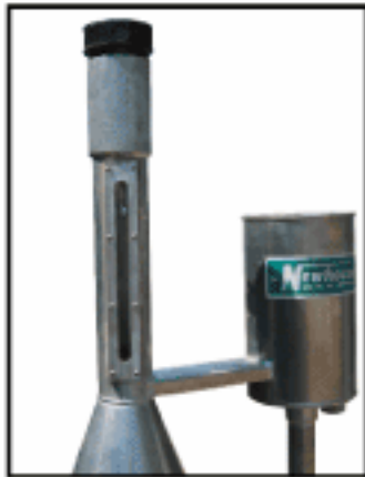
SIGHT GAUGE SEALED INCANDESCENT LIGHT FIXTURE WITH SWITCH, ILLUMINATES OIL LEVEL AND OIL MOVEMENT.