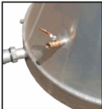
BUILT-IN STEAM NOZZLE FOR PREHEATING AND CLEANING.