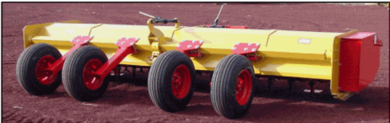
REAR VIEW OF ADJUSTABLE DEPTH WHEEL TOOL BAR

NEWHOUSE MANUFACTURING COMPANY INC. 1048 N. SIXTH STREET, REDMOND OR 97756 PHONE: (541) 548-1055 FAX: (541) 548-4144 WEB SITE: www.newhouse-mfg.com E-mail: info@newhouse-mfg.com