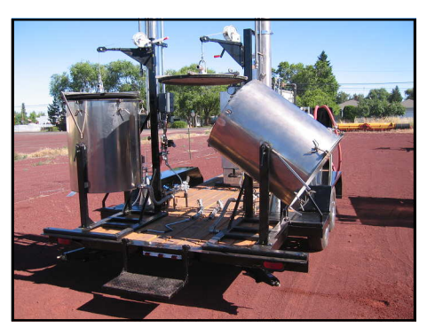
EOS STILL IN DUMPING POSITION WITH NEW CUTOUT IN TRAILER TO ALLOW FOR EASIER DUMPING