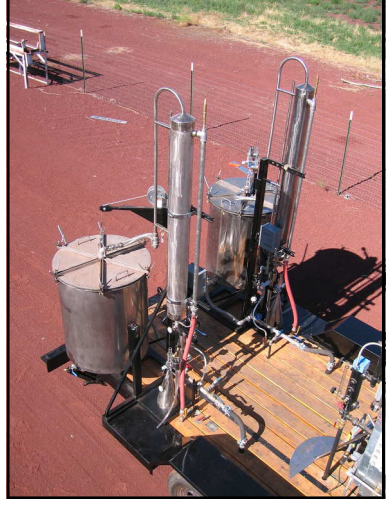
NEW!! ALL PLUMBING IS RUN UNDERNEATH THE TRAILER FOR AN OPEN CLEAN WORK SPACE