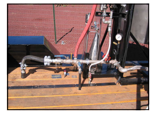
STEAM & WATER MANIFOLDS ARE USED FOR EASY ADDITION OF SECOND STALL AND FOR CONSOLIDATED PLUMBING