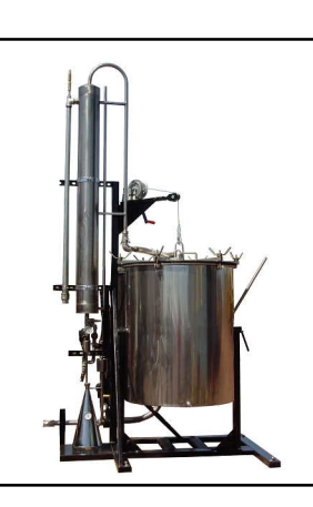
STANDARD NEWHOUSE EOS STILLS ARE USED ON THE TRAILER FOR EASY REPLACEMENT AND ADDITION OF STALLS