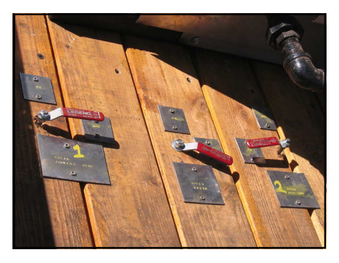
NEW!! ALL CONTROL VALVES ARE CLEARLY LABELED FOR EASY OPERATION