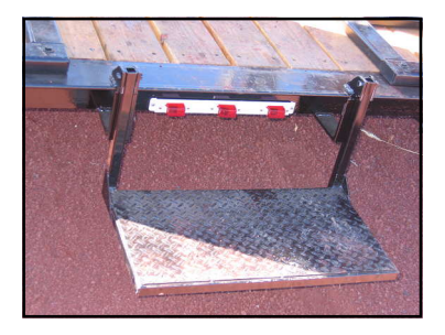
NEW!! FLIP DOWN STEP ON THE BACK OF THE TRAILER ALLOWS FOR EASY ACCESS TO THE REAR DECK